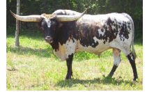
Horseshoe J Charm