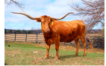
BL Coach's Desperado